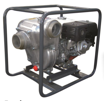
Transfer pumps ... Move water fast