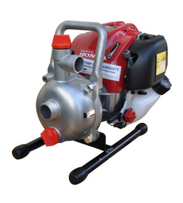
Ultralites ... Portable pumps