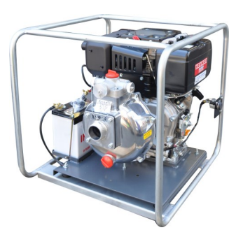
Twin Impellers ... Extra performance