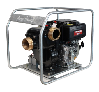
Marine pumps ... Corrosion resistant

To find your local authorised Aussie QP Distributor, visit the Aussie pump website.