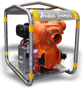
Trash pumps ... Dirty water solutions