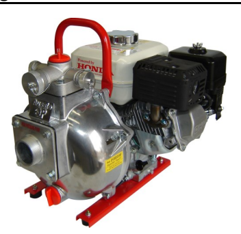
Fire Pumps ... World's best portable range